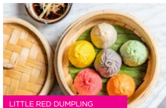
LITTLE RED DUMPLING

A unique restaurant that combines the gourmet-style of Chinese cuisine with a quick-service format, serving up fresh meals made from locally sourced ingredients.