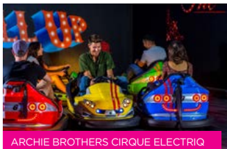
ARCHIE BROTHERS CIRQUE ELECTRIQ

Queensland's first circus-slash-arcade bar and restaurant offering everything from vintage arcade games and dodgem cars to cocktails topped with fairy floss and stuffed with Golden Gaytimes.