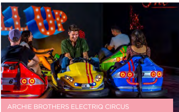
ARCHIE BROTHERS ELECTRIQ CIRCUS