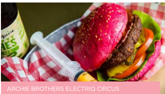
ARCHIE BROTHERS ELECTRIQ CIRCUS