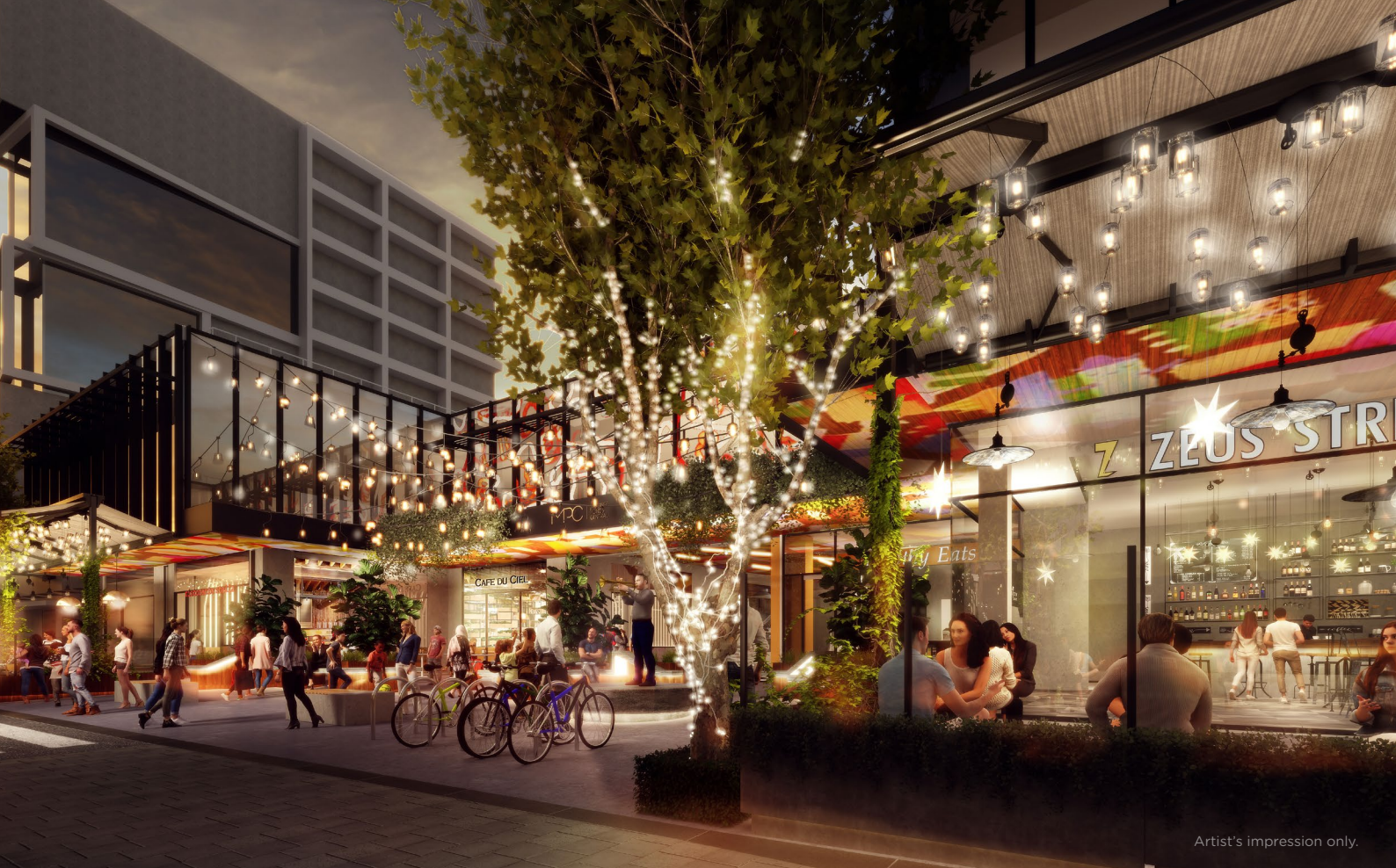
Artist's impression only.