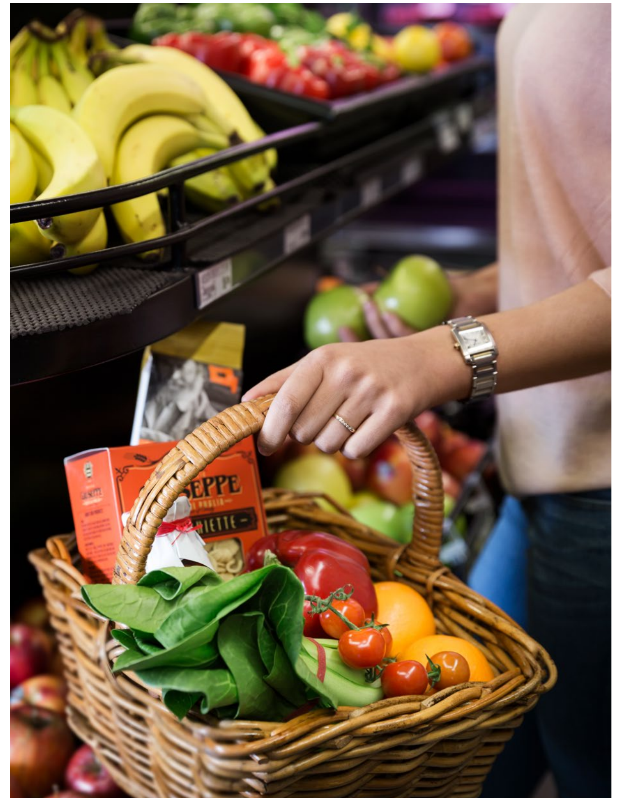
The Village Store

Everyone needs their daily coffee fix, and Waverley Park offers it with style. Highly renowned in the south east, The Last Piece provides a relaxed environment to share food, drinks and quality time with family and friends.