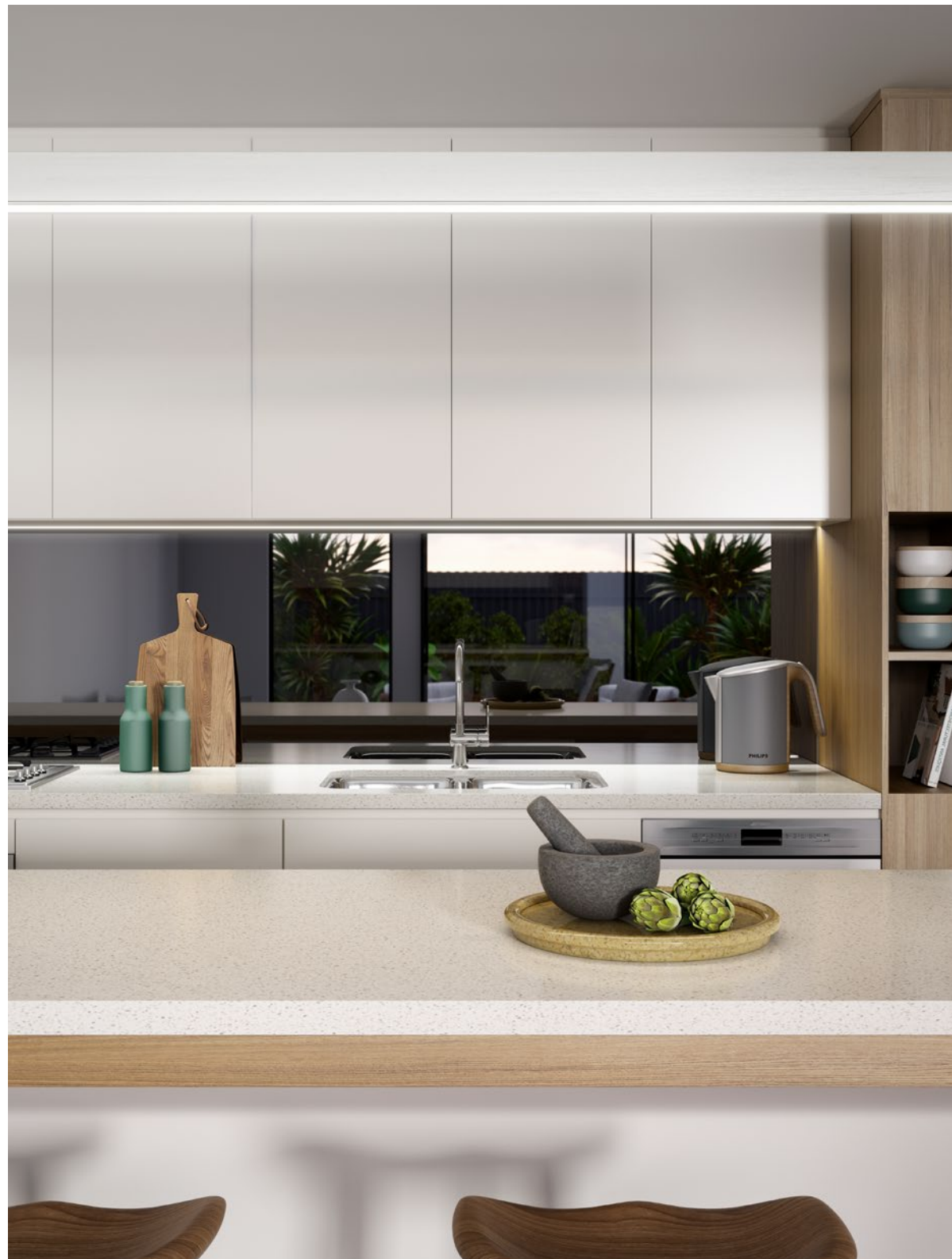
Artist impression only: Kitchen, Lake scheme. Finishes and fixtures are subject to change.