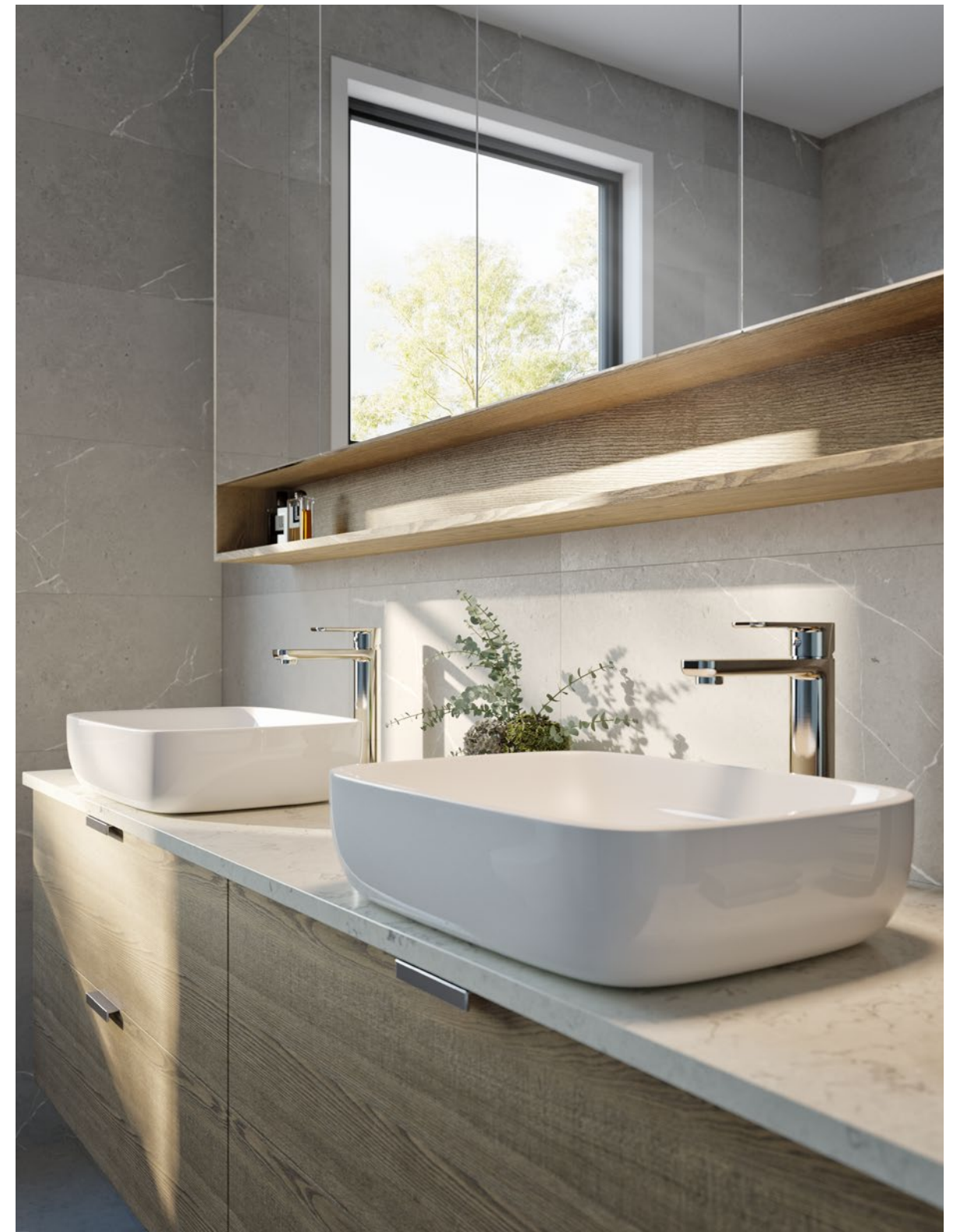
Artist impression only: Bathroom, Park scheme. Finishes and fixtures are subject to change.