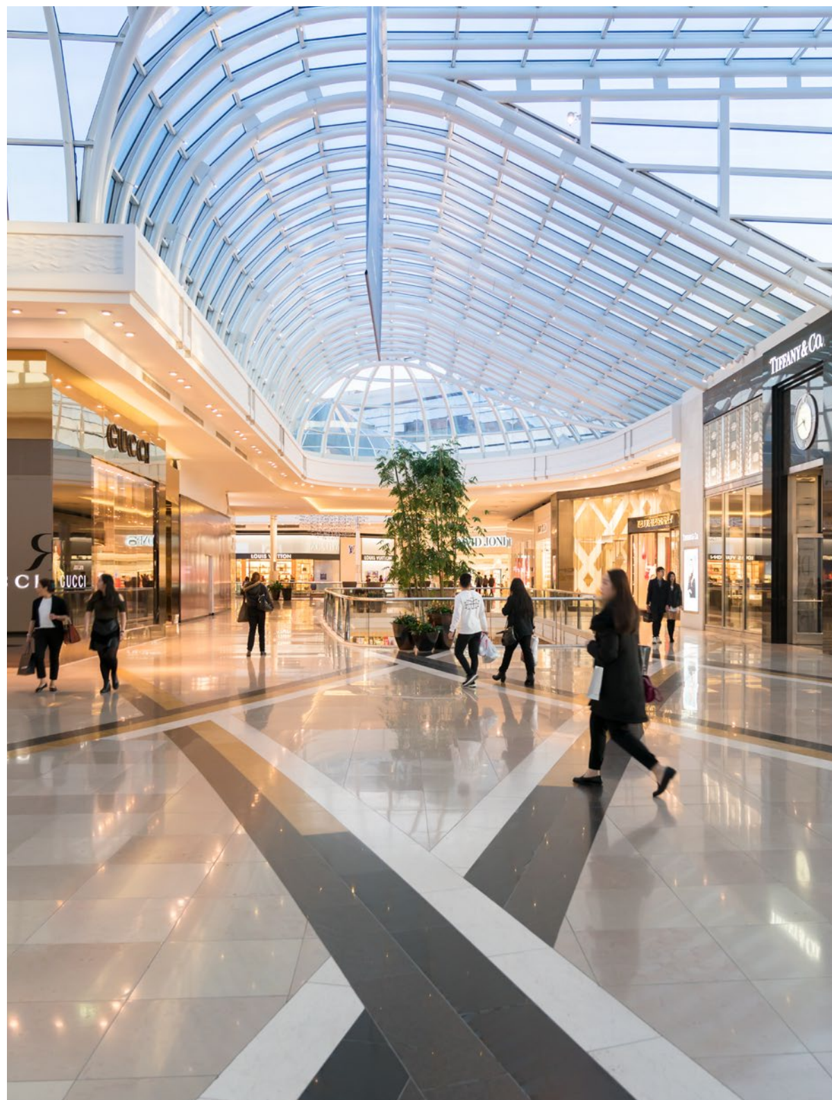
Chadstone Shopping Centre