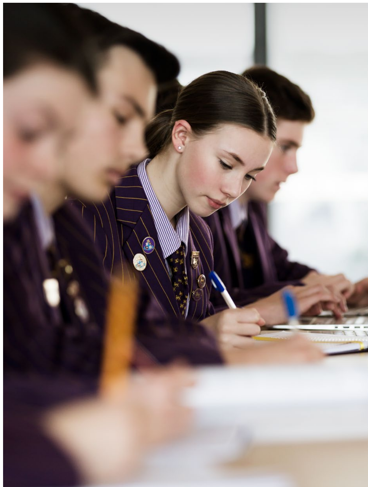
Wesley College, Glen Waverley