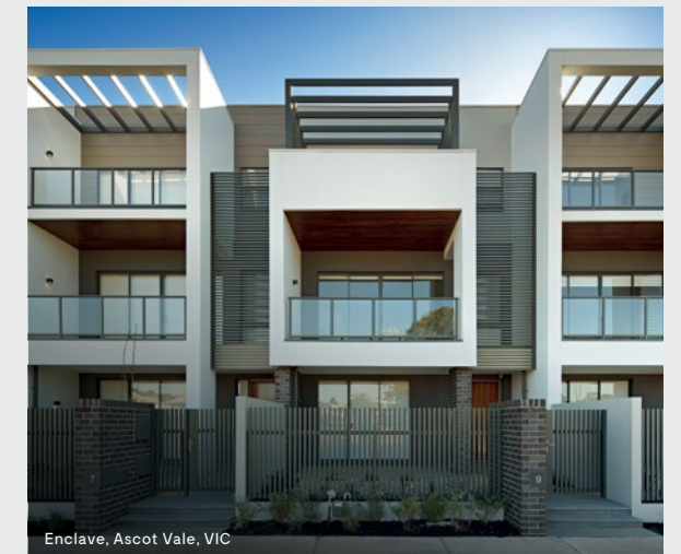
Enclave, Ascot Vale, VIC