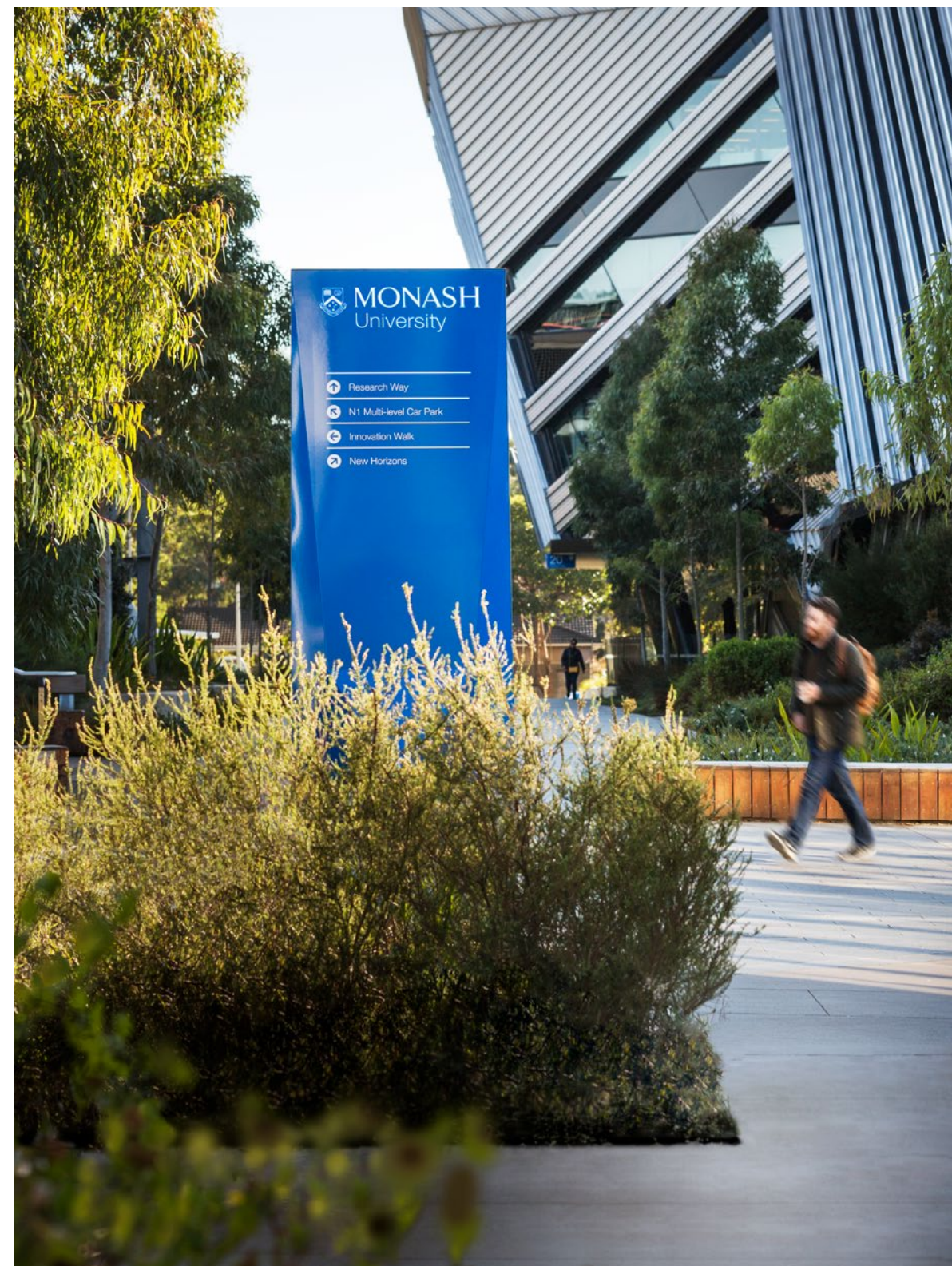
Monash University, Clayton Campus

Providing lifelong skills, from prep to year 12, quality schooling provides the foundations for the future. Take your pick from a number of private and public primary schools, grammar schools and colleges, including the esteemed Wesley College.