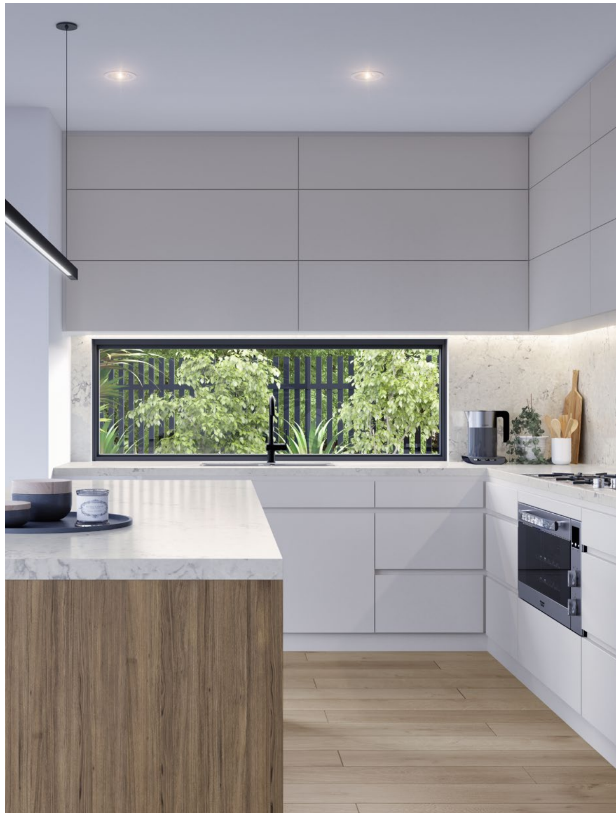
Artist impression only: Kitchen, Park scheme. Finishes and fixtures are subject to change.