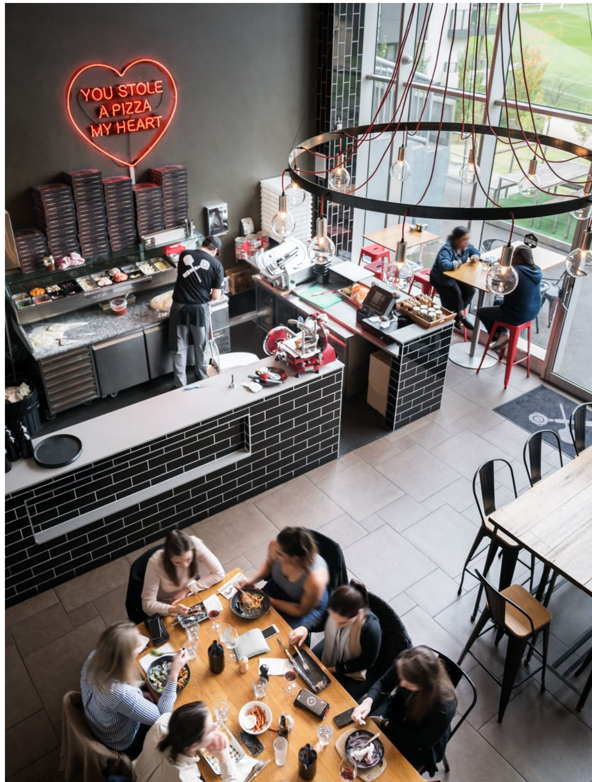
The Last Piece Café

Everyone needs their daily coffee fix, and Waverley Park offers it with style. Highly renowned in the south east, The Last Piece provides a relaxed environment to share food, drinks and quality time with family and friends.