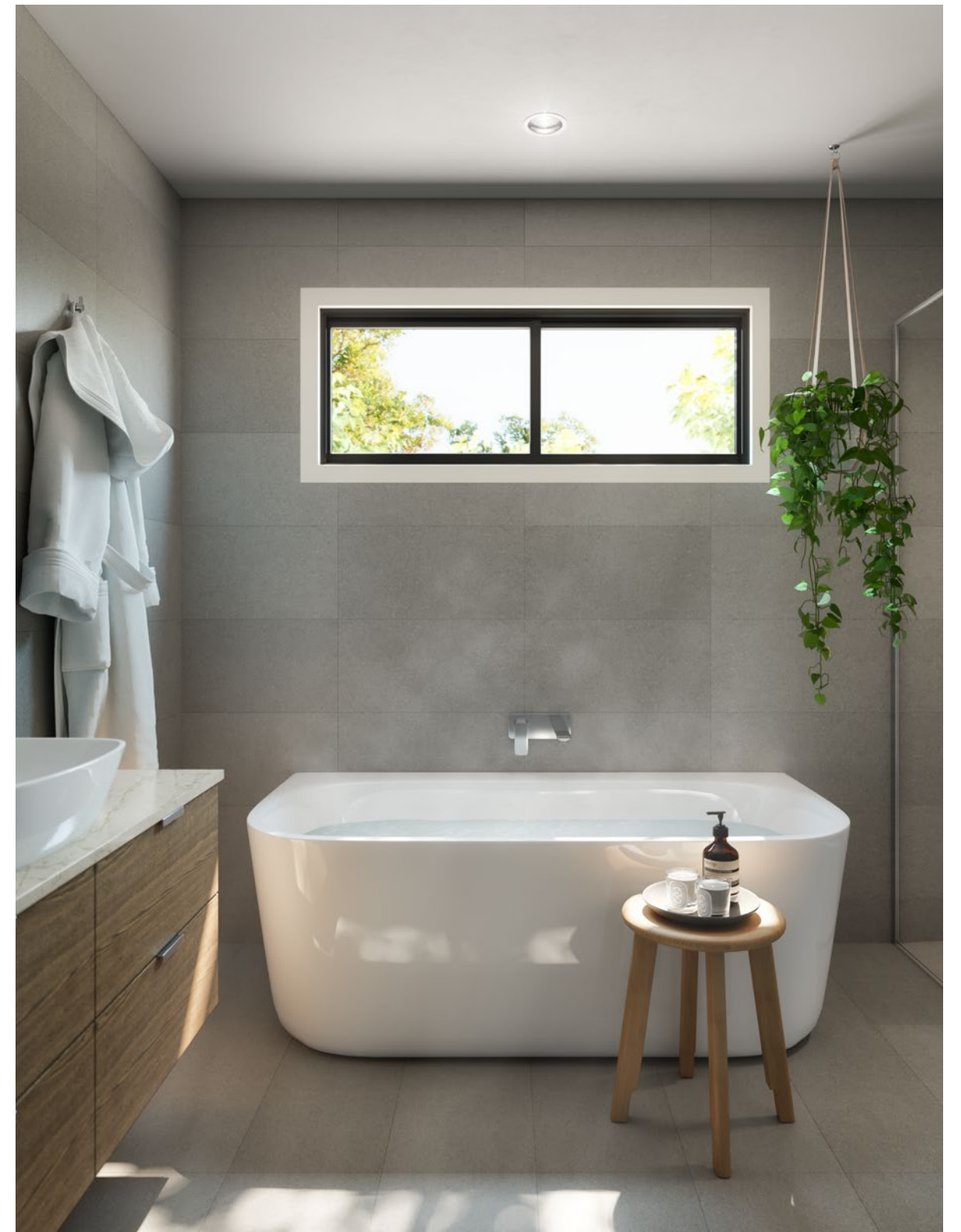
Artist impression only: Bathroom, Lake scheme. Finishes and fixtures are subject to change.