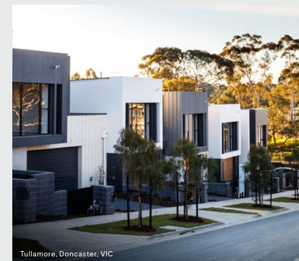
Tullamore, Doncaster, VIC