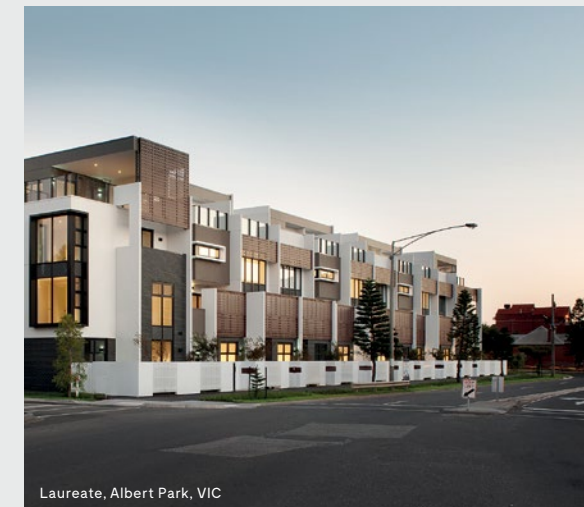
Laureate, Albert Park, VIC