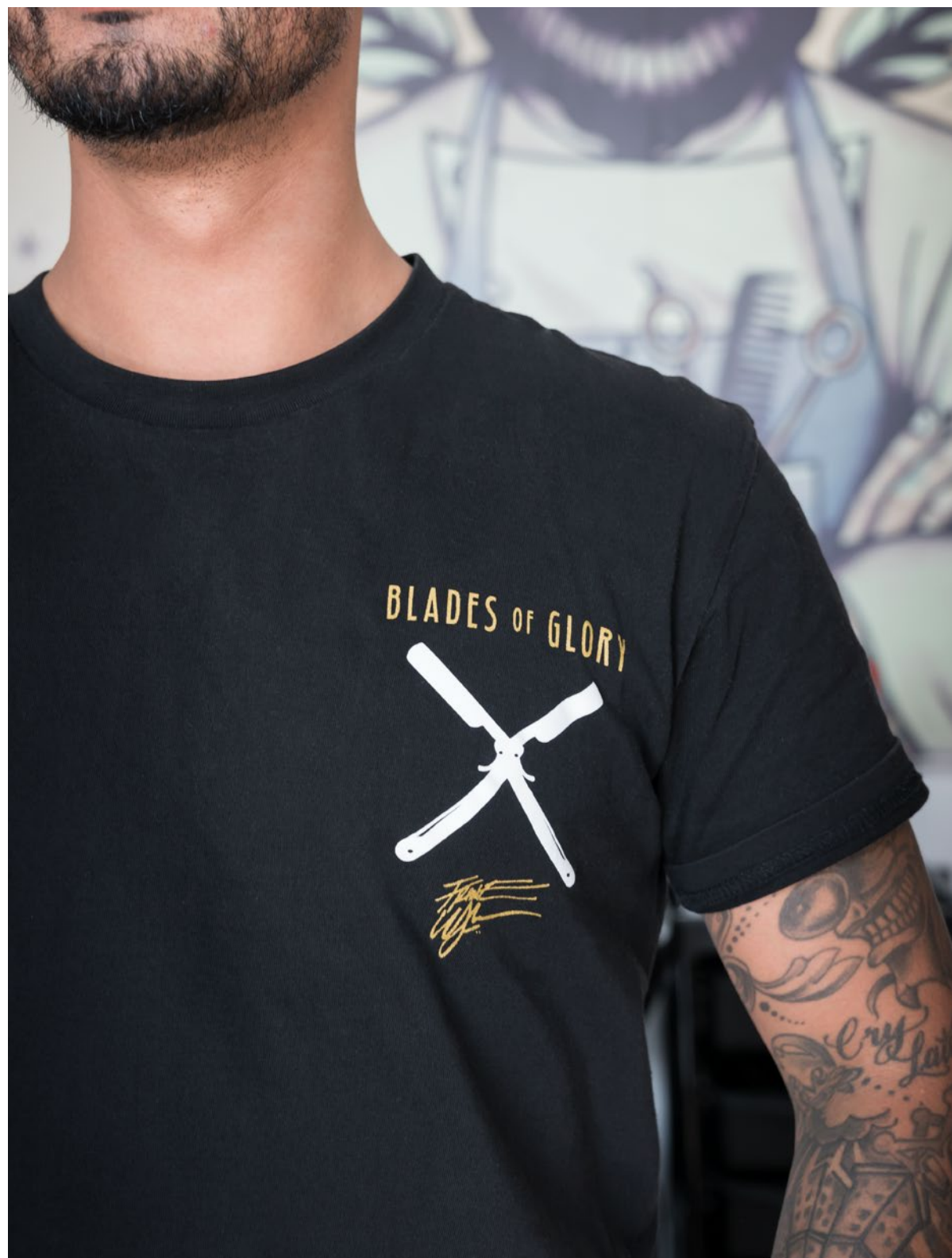
Blades of Glory Barber

Specialty retailers unique to the precinct, like Hawksnest Memorabilia or Waverley Park Dental Care, Blades Of Glory is your local barber that's a cut above the rest. Whatever you're after, Waverley Park has you covered.