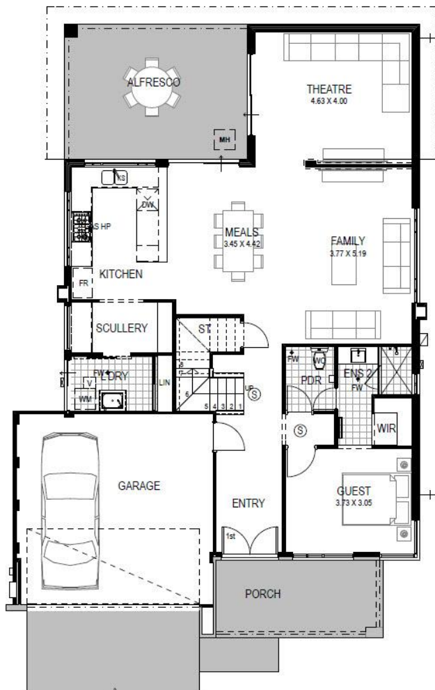
GROUND FLOOR PLAN SCALE 1:100