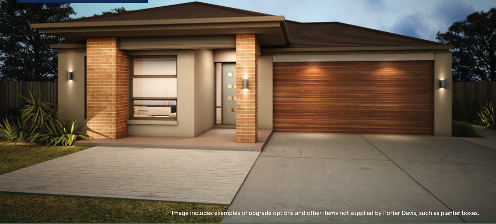
Image includes examples of upgrade options and other items not supplied by Porter Davis, such as planter boxes.