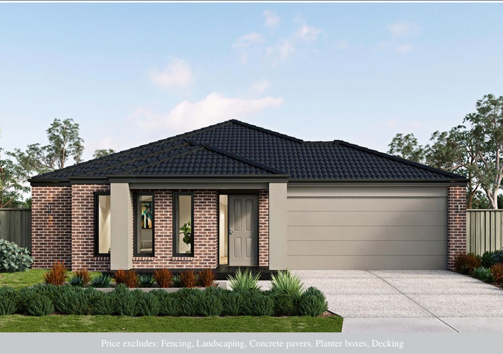
Price excludes: Fencing, Landscaping, Concrete pavers, Planter boxes, Decking