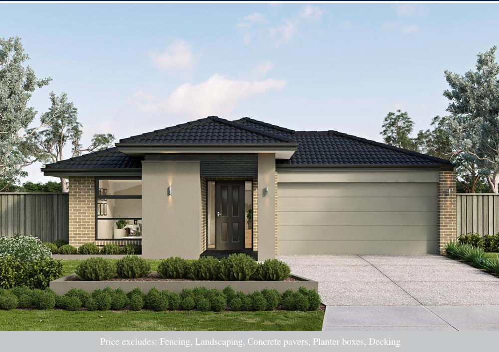
Price excludes: Fencing, Landscaping, Concrete pavers, Planter boxes, Decking