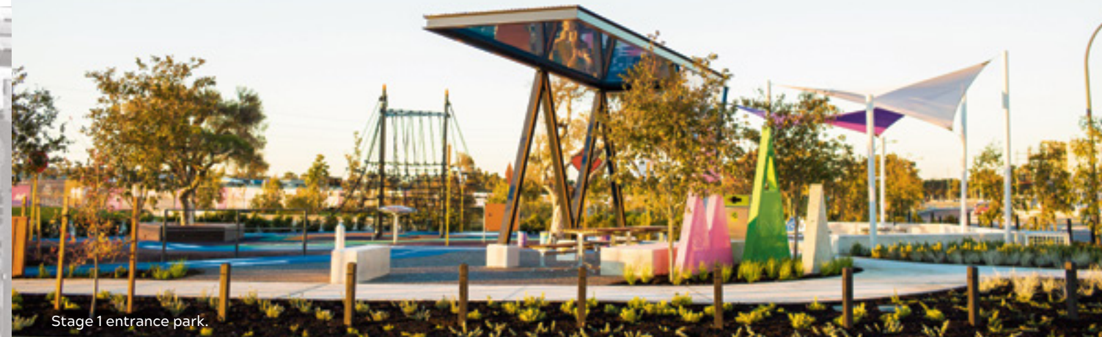
Stage 1 entrance park.