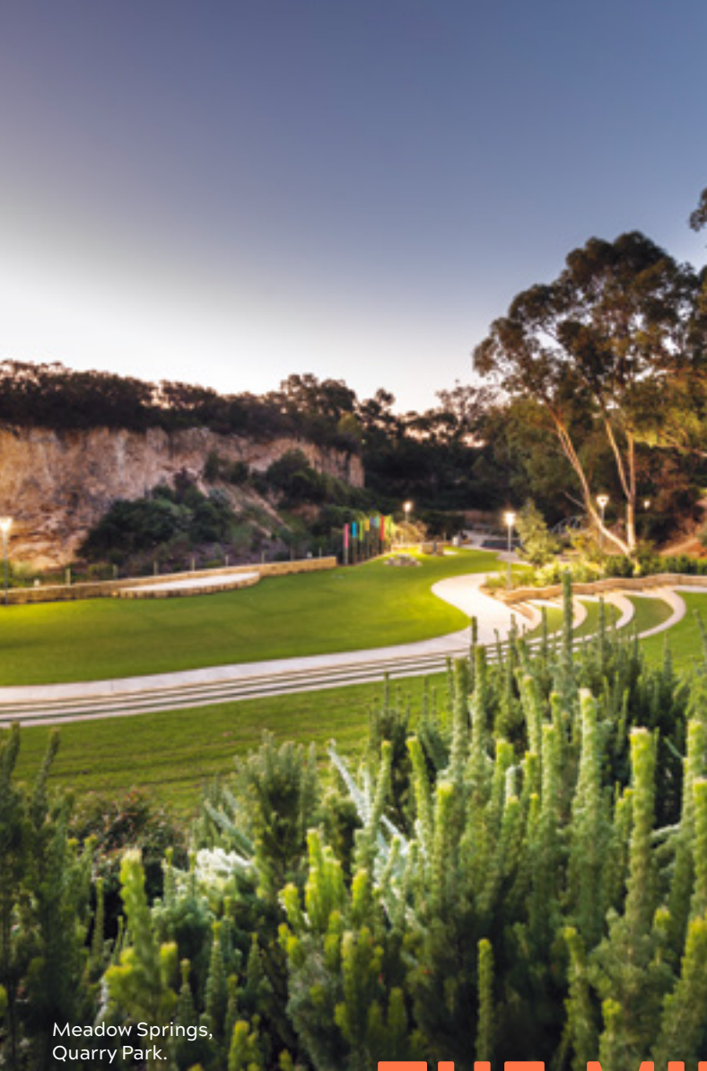
Meadow Springs, Quarry Park.