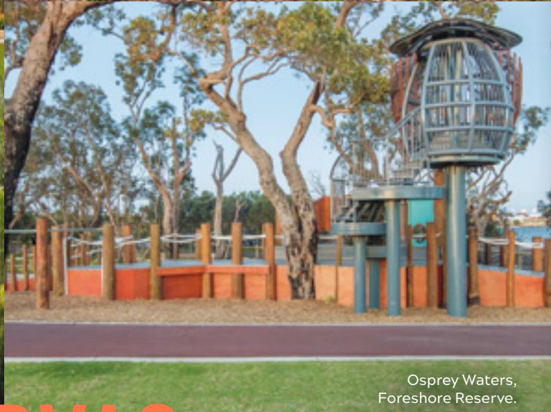
Osprey Waters, Foreshore Reserve.