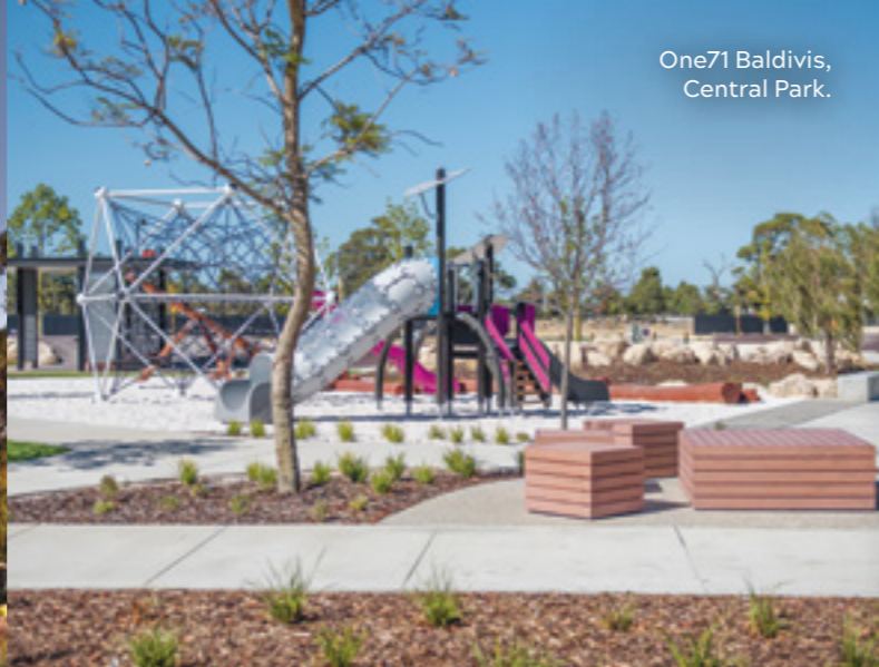
One71 Baldivis, Central Park.