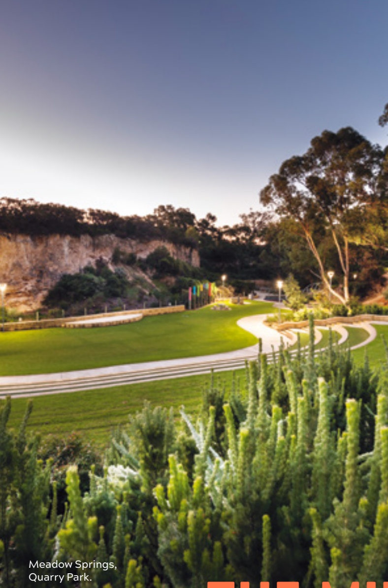
Meadow Springs, Quarry Park.