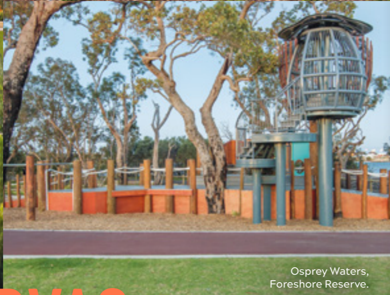
Osprey Waters, Foreshore Reserve.