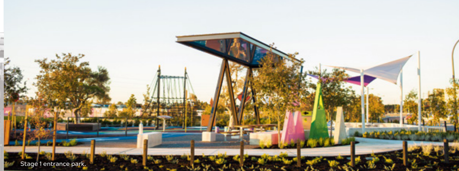
Stage 1 entrance park.