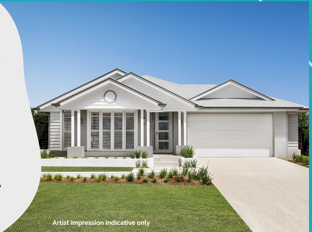
Artist impression indicative only