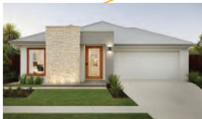
Coral Homes Grange 25 Crest Facade

Home Size: 266.95m 2 Lot Size: 516m 2 Lot Frontage: 16m