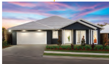
GJ Gardner Homes Cooloom Hamptons Facade

Home Size: 322.33m 2 Lot Size: 540m 2 Lot Frontage: 18m