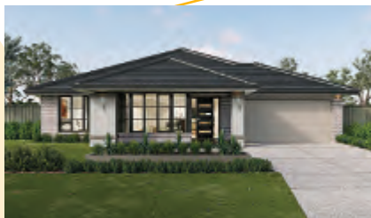
Metricon Mantra 28A Domain Facade

Home Size: 285m 2 Lot Size: 480m 2 Lot Frontage: 16m