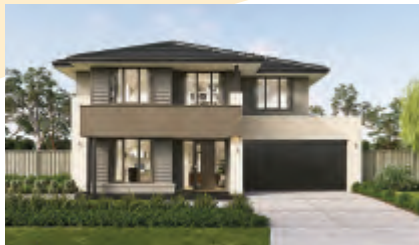
Metricon Fintona 33 Alpine Facade

Home Size: 308.02m 2 Lot Size: 420m 2 Lot Frontage: 14m