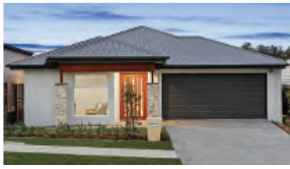
GJ Gardner Homes Kimberley Resort Facade

Home Size: 248.18m 2 Lot Size: 420m 2 Lot Frontage: 14m