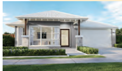
Bold Living Homes Sophia 253 Ranch Facade

Home Size: 298.31m 2 Lot Size: 503m 2 Lot Frontage: 16m