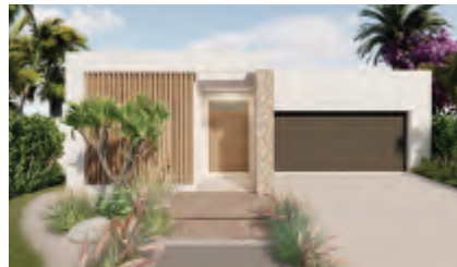
Hallmark Homes Urban 245

Home Size: 225m 2 Lot Size: 375m 2 Lot Frontage: 12.5m