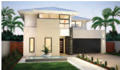
Clarendon Homes Brookwater 33 Contemporary Facade

Home Size: 252.01m 2 Lot Size: 471m 2 Lot Frontage: 16m