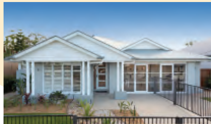
Plantation Homes Portland 25 Eastport Facade

Home Size: 253.1m 2 Lot Size: 448m 2 Lot Frontage: 14m