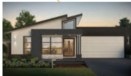
Desire Homes Diamantina 250 Stradbroke Platinum

Home Size: 255m 2 Lot Size: 480m 2 Lot Frontage: 16m