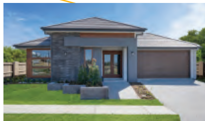
Bold Living Homes Newport 297 Modern Facade

Home Size: 238m 2 Lot Size: 448m 2 Lot Frontage: 14m