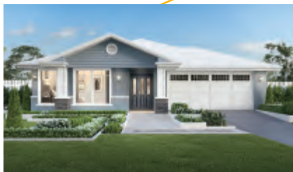
Clarendon Homes Ashgrove 29 Hamptons Facade

Home Size: 230.8m 2 Lot Size: 375m 2 Lot Frontage: 14m