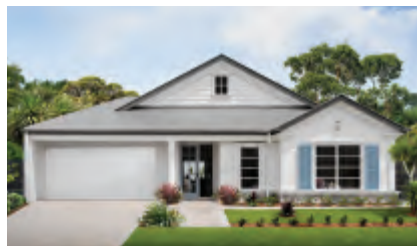
Porter Davis Homes Palmview 31 Shelter Island Facade

Home Size: 285m 2 Lot Size: 480m 2 Lot Frontage: 16m