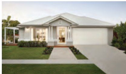
Coral Homes Santorini 27 MK II East Hamptons Facade

Home Size: 308.02m 2 Lot Size: 420m 2 Lot Frontage: 14m