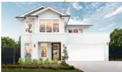
Brighton Homes Huxton 35 Emerson Facade

Home Size: 270.50m 2 Lot Size: 531m 2 Lot Frontage: 18m