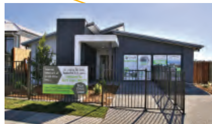
DBC Homes The Taylor Contemporary Facade

Home Size: 279m 2 Lot Size: 486m 2 Lot Frontage: 16m