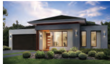
Neptune Homes Santa Rosa Tempo Facade

Home Size: 245m 2 Lot Size: 375m 2 Lot Frontage: 12.5m