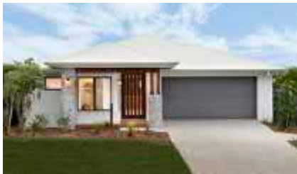
Brighton Homes Meridian 27 Seaside Facade

Home Size: 325.27m 2 Lot Size: 420m 2 Lot Frontage: 14m