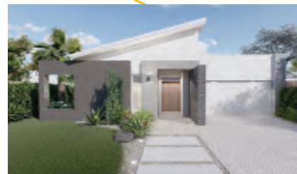
Hallmark Homes Verge 279

Home Size: 250m 2 Lot Size: 420m 2 Lot Frontage: 14m