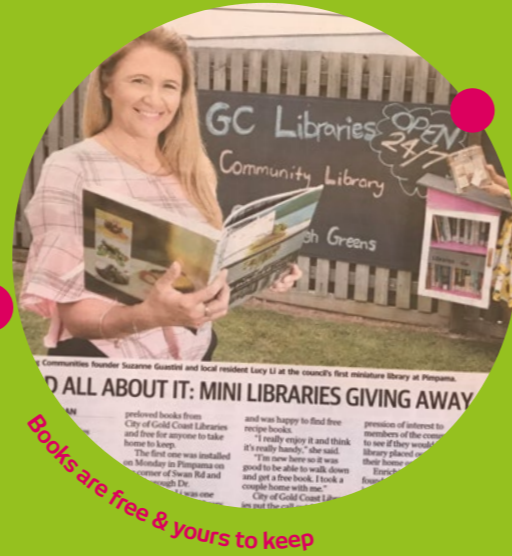
Books are free & yours to keep