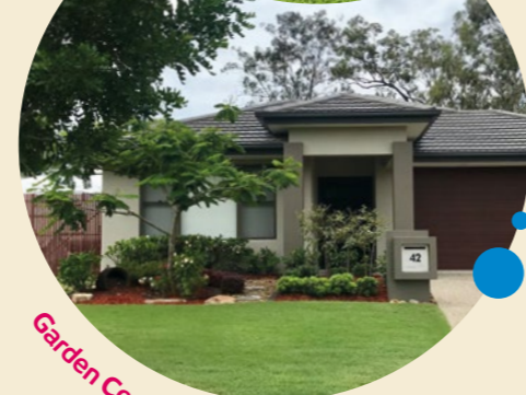
Garden Competition Winners