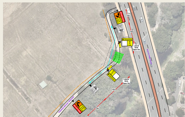
Kedron Brook Bikeway - Partial Closure Location 1