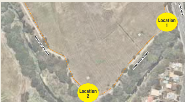
Kedron Brook Bikeway - Partial Closure Cross Streets: Ashmore Street - South Pine Road