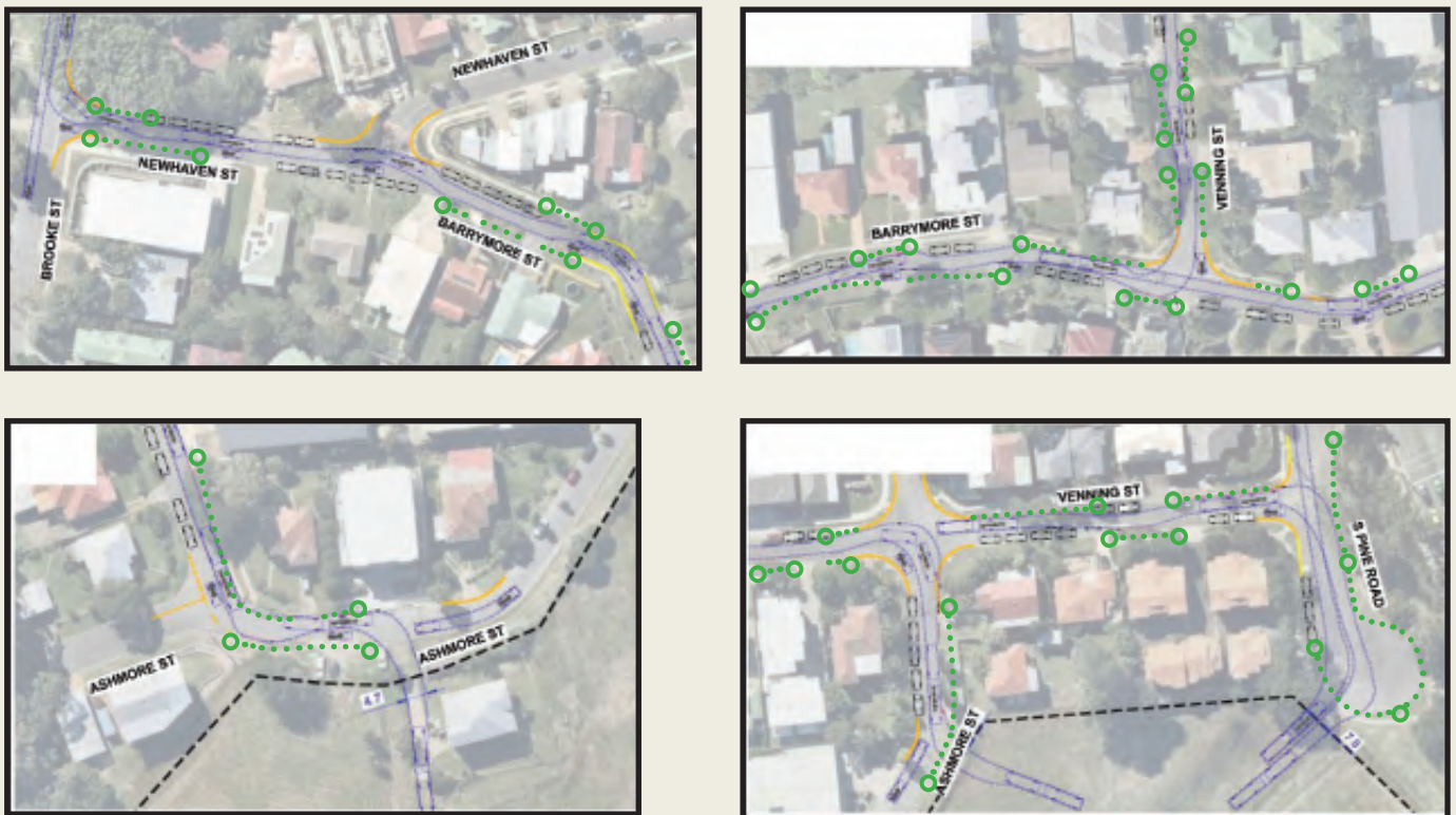
Figure 5. Signage and line markings

The intent of this signage and line marking is to ensure safety for the local community. Proposed new signage and line marking are detailed below;