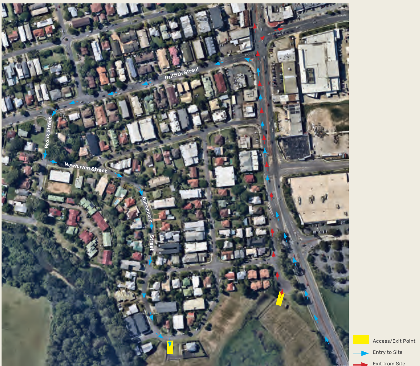
Figure 4. Site entry and exit points

For the duration of the construction works of Stage 1 to Stage 3B there is proposed to be one main access route to and from the site. Please note that on occasion, it may be required that a different route be taken.