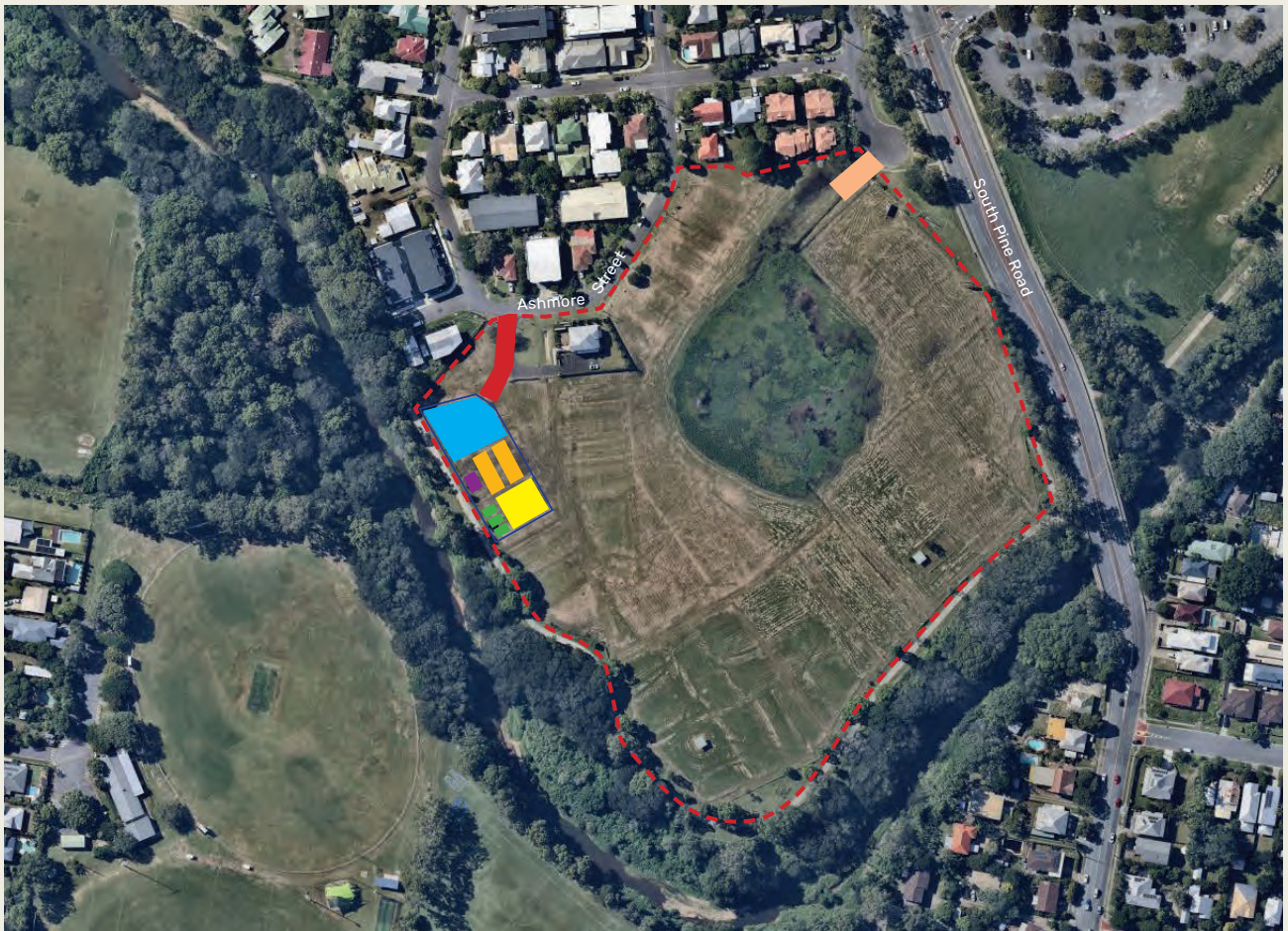
Figure 2. Site layout plan

During the first phase of construction as detailed on Page 4, the civil contractor's compound will be located as detailed in the site layout plan below. Onsite parking will be provided in this location during construction, ensuring that no vehicles associated with this development are parked on public roads.