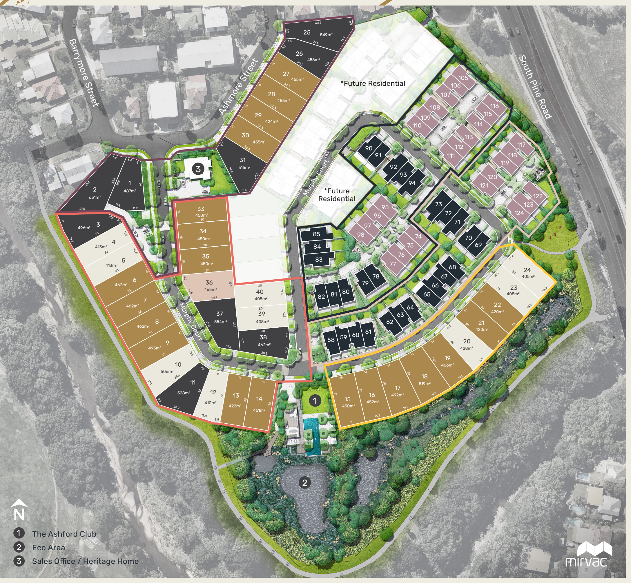
*Important Information: The masterplan was prepared prior to construction and is indicative only and not intended to be a true representation of the final product as developed. This masterplan is believed to be correct as at February 2021, but is not guaranteed. Changes may be made to all aspects of the development (including, without limitation, to the layout, composition, streetscape, dimensions, specifications, service locations, eco area and resident's amenity) during the development without notice. The levels and water colour of the Eco Area are seasonal and may vary throughout the year. Dimensions are approximate only and may be the sum of multiple truncations. Please refer to the contract plans and specifications, as this lot plan is for general guidance only. The areas indicated Future Stage at the date of preparation of this master plan, may be developed by Mirvac in the future subject to receipt of development approvals and market conditions. Mirvac may sell some or all of these sites to third party developers. Timing is unknown. The outline of these areas indicates the general outline of the developable footprint for the ground floor which is permitted by the relevant planning controls. Version 2 – February 2021.